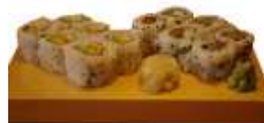
Maki Combo 2