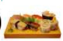
Sushi Combo H