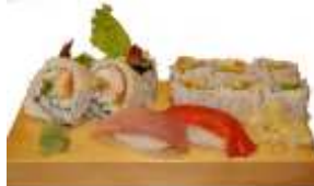
Sushi Combo B