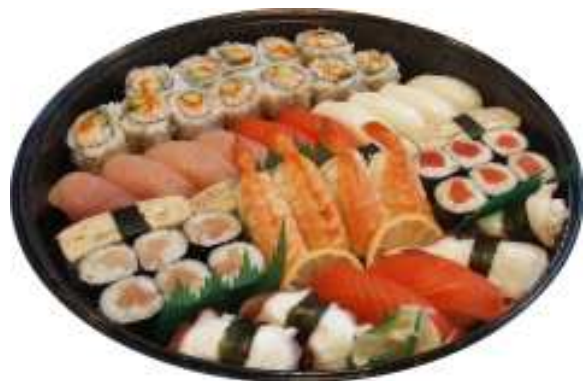
Party Tray C

Party Tray C (4~5 persons, 48 pc.) 42.00 4pc ea. of tuna, salmon, ebi, ika, tako, tamago; 2 california rolls, 1 tuna roll, 1 salmon roll