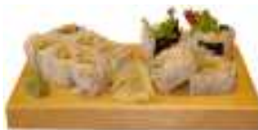
Maki Combo 1

alcoholic beverages are not available for takeout